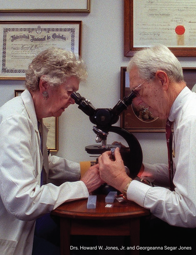
Drs. Howard W. Jones, Jr. and Georgeanna Segar Jones

“As had Dr. Howard’s and Dr. Georgeanna’s, my career in reproductive medicine has spanned the arc of human IVF treatment. Like many others who followed them, I was indebted to have had Dr. Howard as a mentor and even have him co-author a scientific paper – one of his last – on the importance of elective Single Embryo Transfer. We take very seriously the honor - and responsibility – we have in this field of science and medical treatment to carry on their legacy through the Jones Foundation”.